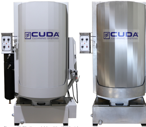
Shown with filtration and deluxe kit with side sink