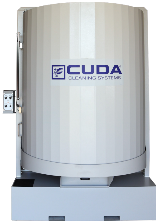
Approx. scale to 7272 model