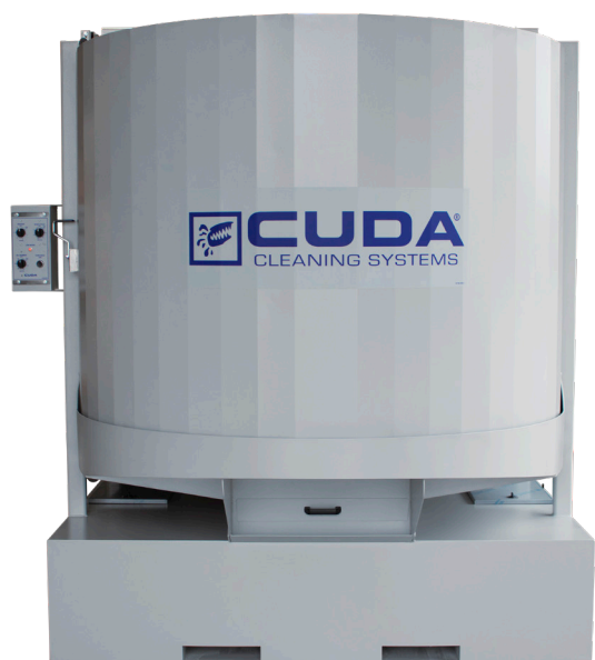
Approx. scale to 7248 model

Cuda's 7248 features a large 72-inch turntable diameter, allowing users to clean a wide range of industrial components. Its working height stands at 48-inches, and it boasts a load capacity of 5000 lbs. The 7248 series is equipped with a 10 HP vertical seal-less pump producing 160 GPM at 50 PSI, and has a 200-gallon sump capacity.